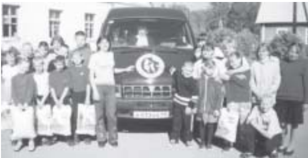
Idritsa orphans proudly display their new bus