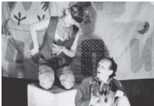
Actors perform for students

career in the Pantomine Theatre, has been a great asset to the school. She teaches students about the principles of theatre and