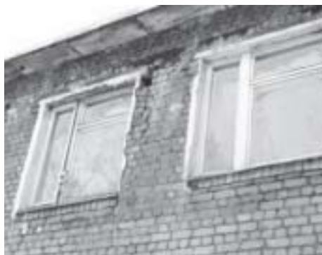
Pre-repair condition of roof

gering the 57 children who live in the orphanage intended for only 30 inhabitants.