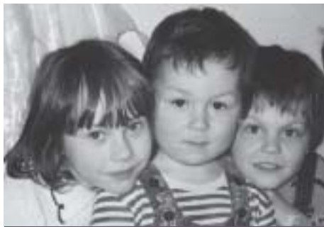
Children making friends at the shelter

Many of the children who enter the shelter come from homes ravaged by violence, neglect, and alcoholic parents. Sleeping in abandoned buildings or eating out of dumpsters further damages an already brutalized psyche. One shelter resident, a six-year old girl, was running around and fell down, accidentally dirtying her dress and the doll she was holding. Her reaction was to bury her head in her