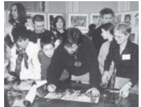
Children gather around Yuri Shevchuk, DDT

work. This site also provides a place to hold innovative projects such as "We Draw a Song." Earlier this year, notables from the Russian music world, including Alexander Rosenbaum, Vyacheslav Butusov, Maksim Leonidov, and Yuri Shevchuk of the rock band "DDT," performed for the children. After the performances, the youngsters interpreted the songs' motifs through drawing and painting. Their work was later exhibited at the "House of Friendship," where the singers reappeared and selected their favorite pieces.