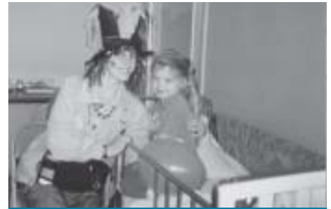
Patch Adams clown with sick child