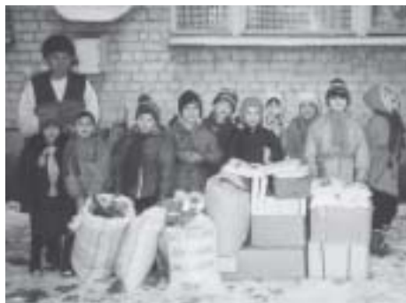
Vladikavkaz orphans with food and clothing delivery

Keeping the St. Nicholas School supplied with teaching materials, furniture, food, and medical supplies is a formidable task. Whereas the St. Nicholas Cathedral had previously offered financial support to the school, it must now devote its resources to the growing number of displaced people in town. RCWS has supported the St. Nicholas School for several years, and allocated $8,500 in 2002 for food, computer equipment, textbooks and other supplies. The Society also wishes to