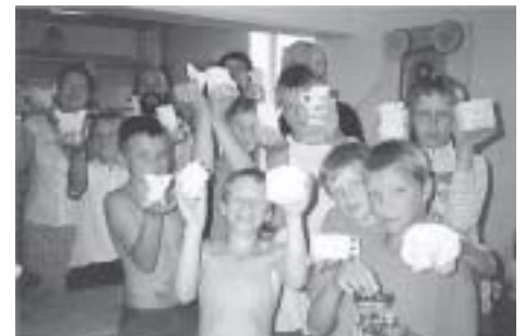
Children display their craft work

The curriculum at Inspiration includes several well-conceived programs that boost the children's self-esteem, bolster their cultural knowledge and instill positive values. One program is called "Ethics and Culture" and is comprised of a series of theme-based discussions and exercises. One lesson, for example, is entitled "The Artist as Prophet," and incorporates the poetry of Pushkin and paintings by Levitan and Cezanne. Another multi-week project called the "Theatre Workshop" introduces the youngsters to different types of theatrical performances and the technical and artistic aspects of staging a spectacle. The children learn by writing their own