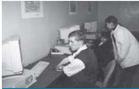
Learning computer applications

The swelling number of abandoned children has imposed a severe strain on the many already overcrowded and often dilapidated orphanage facilities throughout Russia. In Rybinsk, a town located five hours from Moscow in the Yaroslavl oblast, seven new orphanages have appeared since 1995. One of these, Orphanage #79, was opened five years ago in a building designed as a kindergarten during the Khrushchev era. Shoddy construction, combined with poor maintenance during the last forty years, has compromised the safety of the structure. The flat roof is unable to adequately withstand the abundant amount of precipitation of the local climate. As a result, severe leakage problems have damaged ceilings, creating a real threat of collapse and endan-