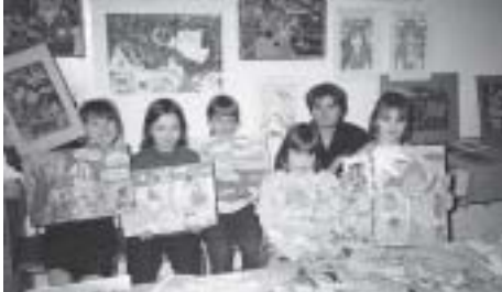
"Our Help" participants with their art work