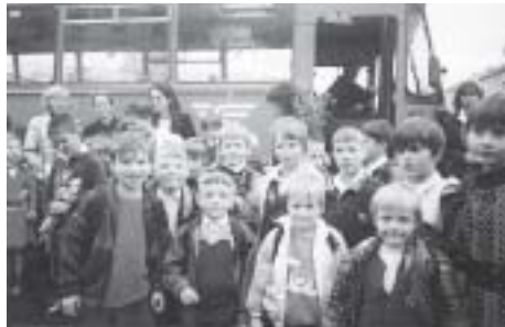
Happy youngsters on an excursion

In January 2001, the Foundation acquired newly renovated space at the Center for Creative Rehabilitation, where drawing, design and computer classes are held, and the children also exhibit their